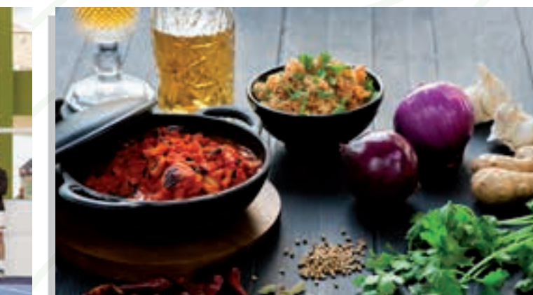
Rajinda Pradesh - New Menu