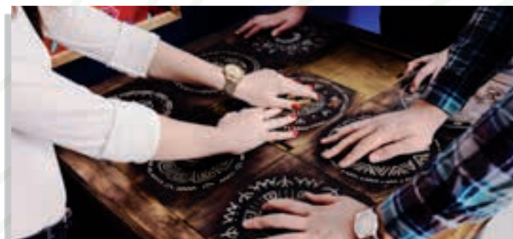
Locked in a Room

To view online or download please visit www.centerparcs.co.uk/Longleat002