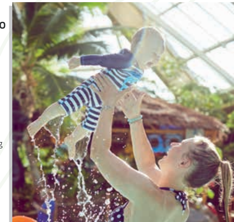
Subtropical Swimming Paradise

Log in to your Center Parcs account to view an itinerary for you and your whole party.