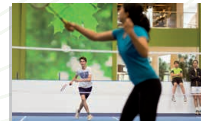
Indoor Sports - Badminton