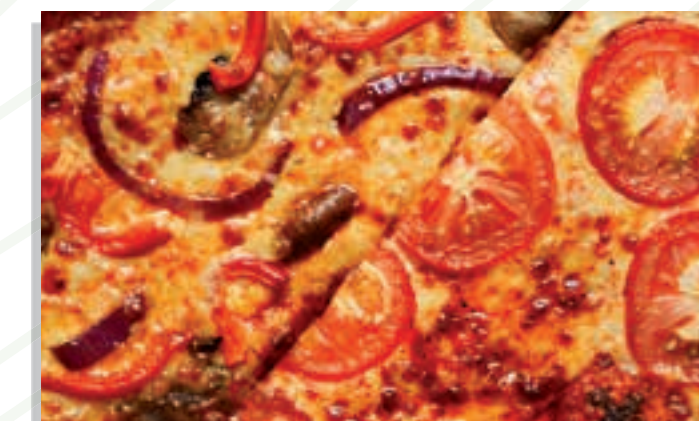
Dining In - New Menu