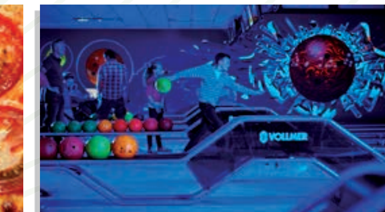
Ten Pin Bowling