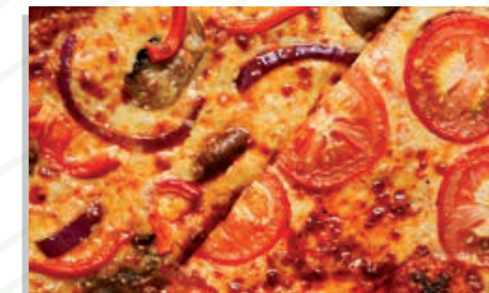
Dining In - New Menu

⚠ Please refer to the Health and Safety Information and Advice in this leaflet before booking any activity.