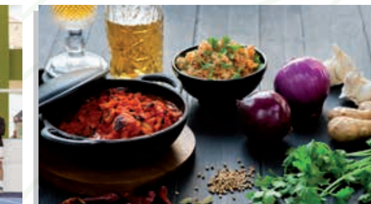
Rajinda Pradesh - New Menu