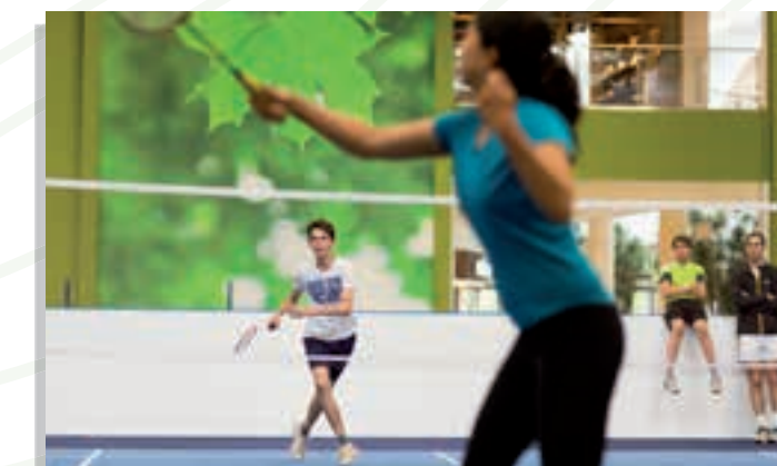
Indoor Sports - Badminton