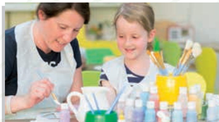
Pottery Painting Studio