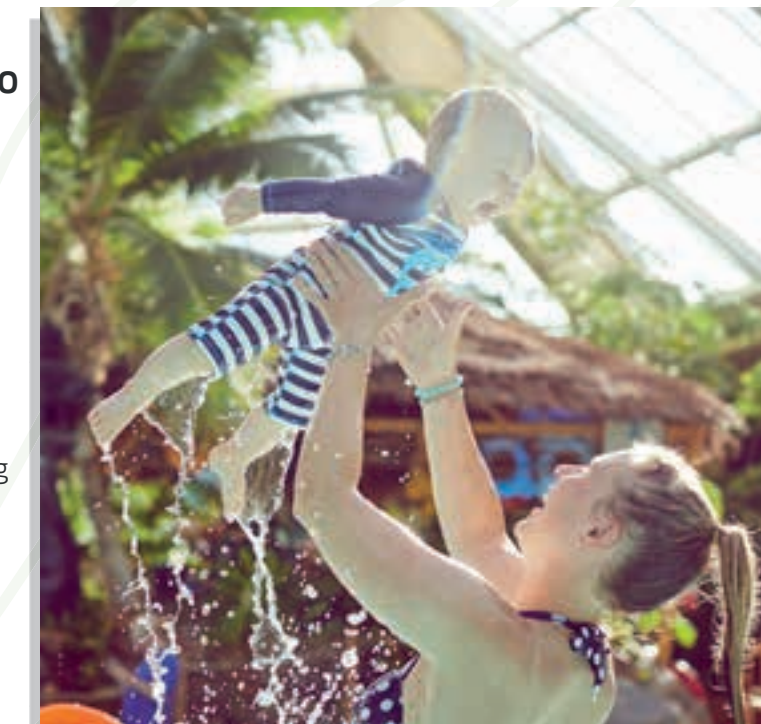
Subtropical Swimming Paradise

Log in to your Center Parcs account to view an itinerary for you and your whole party.