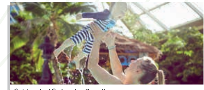
Subtropical Swimming Paradise

Please refer to the Health and Safety Information and Advice in this leaflet before booking any activity.