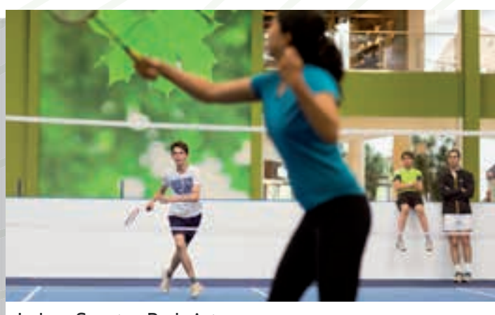
Indoor Sports - Badmintor