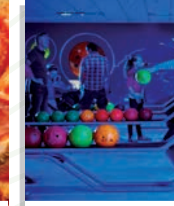
Ten Pin Bowling