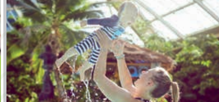
Subtropical Swimming Paradise

To view online or download please visit www.centerparcs.co.uk/Woburn007