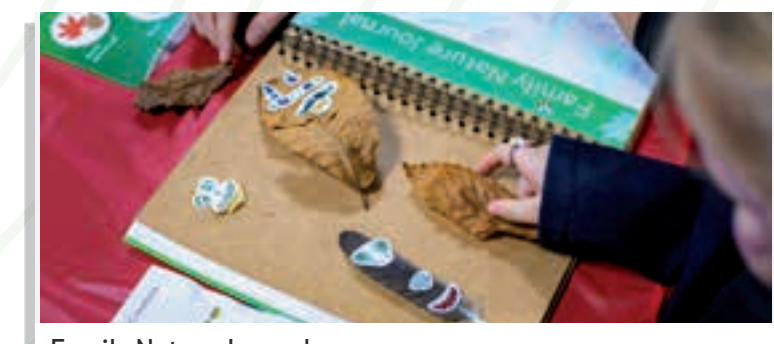
Family Nature Journal

Please refer to the Health and Safety Information and Advice in this leaflet before booking any activity.